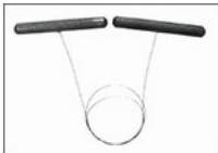
K35 Wire Clay Cutter By Kemper Tools