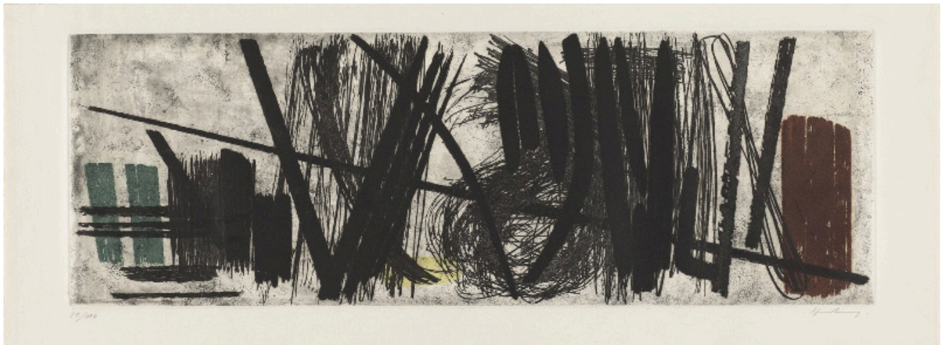
Drawings by Hans Hartung

Line Shape Repetition Pattern Anomaly Texture Density Value Proximity Juxtaposition Balance Hierarchy Contrast Scale Space Duration Figure/Ground